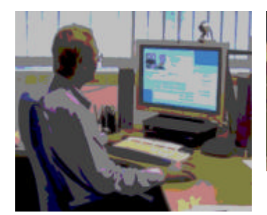
The participants are geographically distributed...they will meet using standard VC software plus the CoAKTinG tools:

Day Two 7.32am The group meets again to review its response.